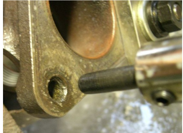
After EDM'ing hole. Thin sleeve of threads left.