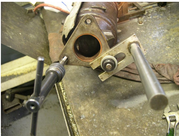
Shows setup and cleanup of threads with tap.