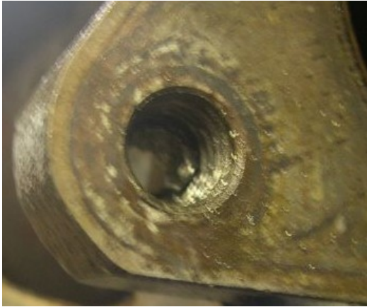
After picking out about half the threads.