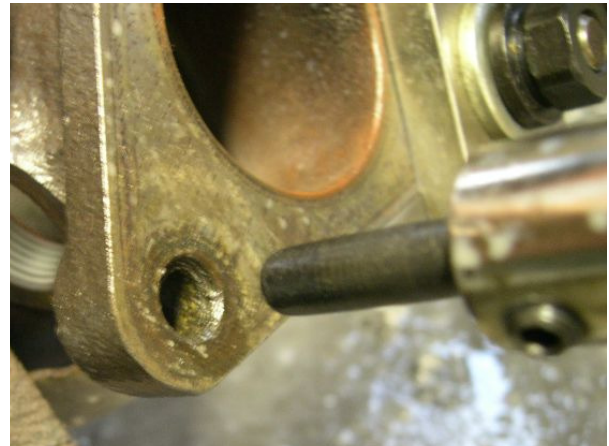
After EDM'ing hole. Thin sleeve of threads left.