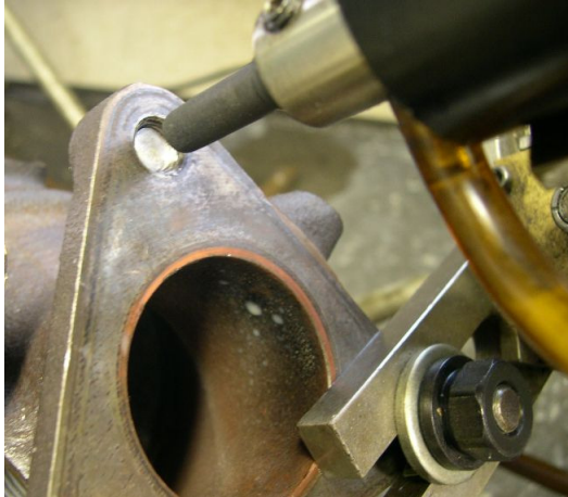
Broken 8mm stud in catalytic converter.