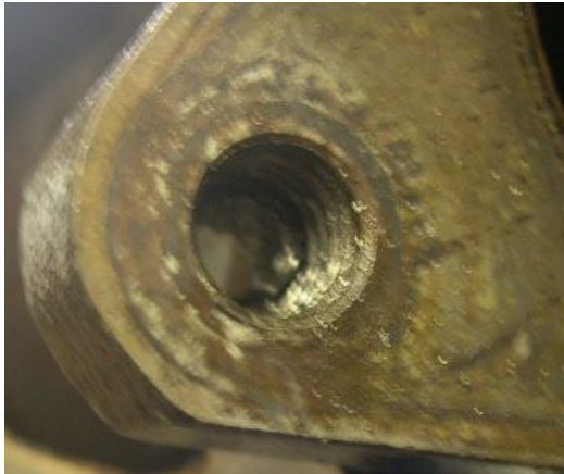
After picking out about half the threads.