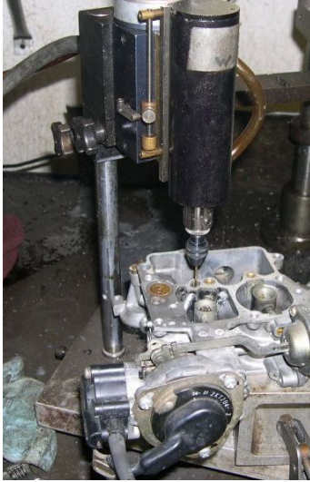
Carburetor with small needle valve screw to be removed. Electrode: .062" Brass tubing. Time: 2 min-