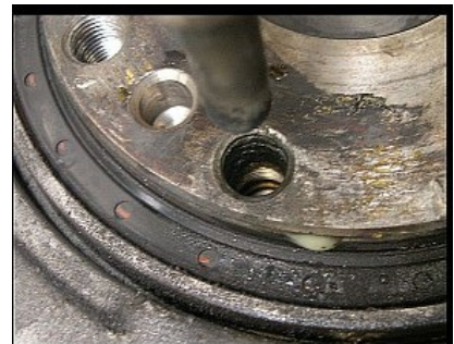
Job: Broken stud in crankshaft end plate. Engine is in vehicle and on a lift with transmission and flywheel removed (photo 1). Machine is set up using a neighbor threaded hole in crankshaft (photo 2). Hole after EDM work and before picking out remaining thread sleeve Electrode: Graphite tube 10 mm stud 20 mm deep Time: 12 minutes. Last photo shows stud removed and ready to pick out remainder of thread sleeve .