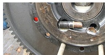
Job: EDM stripped head of ring gear bolt. Then unscrew bolt by hand. Again, working under lift. Rear of engine shown. Electrode Graphite Tube 5/8 OD x 3/8 ID Time = 6 minutes